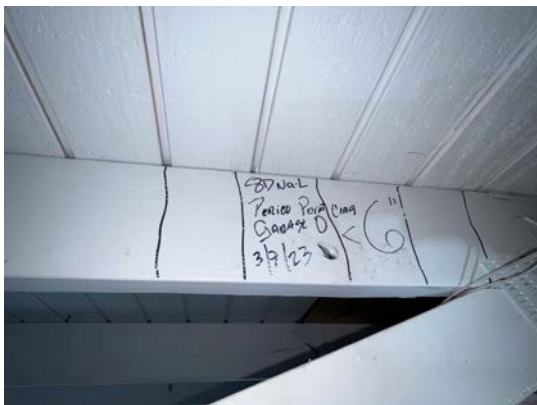
8D Nails Observed