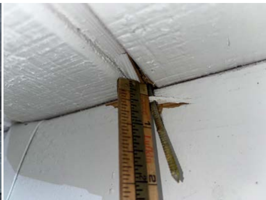
15/32" Roof Decking