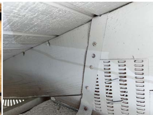
Single Wrap RTW Connection