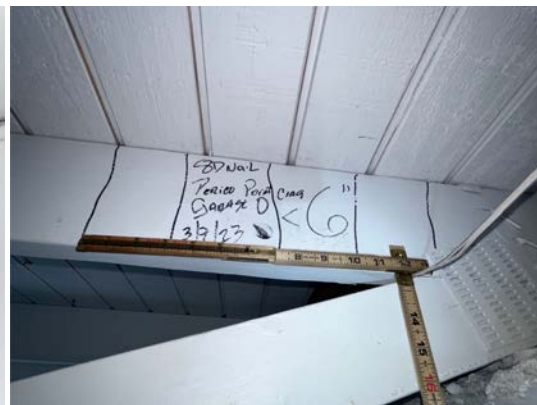
< 6" Nail Spacing