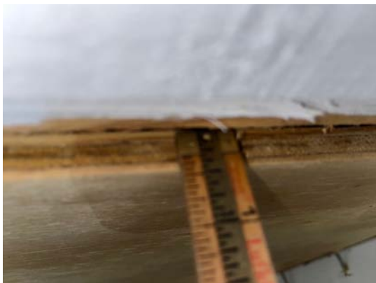
15/32" Roof Decking