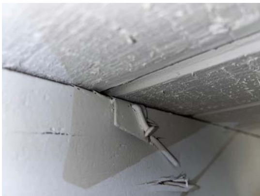
Single Wrap RTW Connection